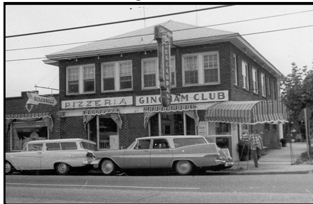
Russo's Gingham Club - 1960