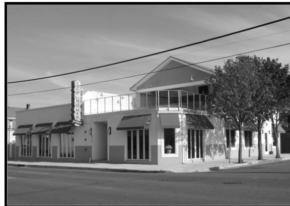
The Ice House Restaurant - 2011