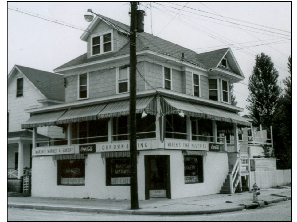
Marsh' Bakery - 1960