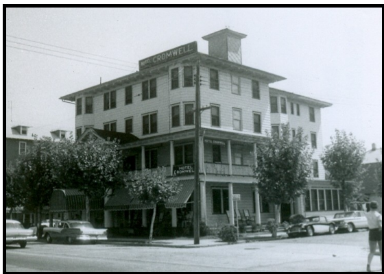
Hotel Cromwell, 1959