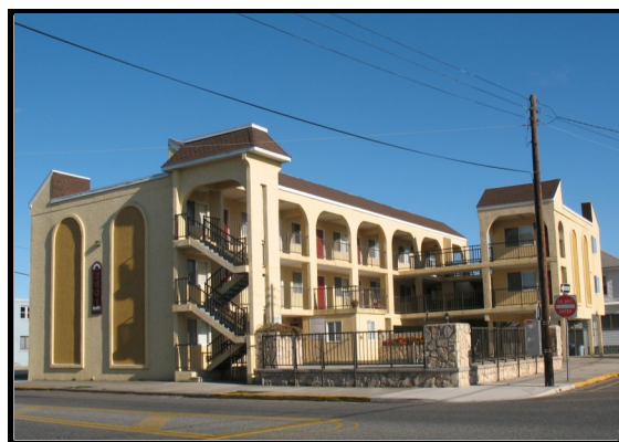
2601 Condos - 2009