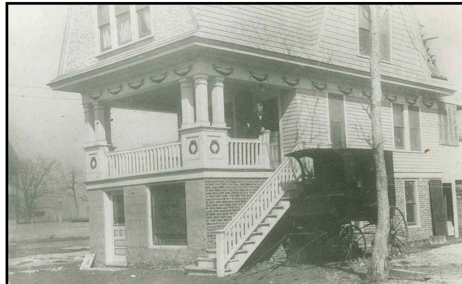
B. C. Ingersoll's first funeral parlor location in 1895, at 215 West Maple Avenue