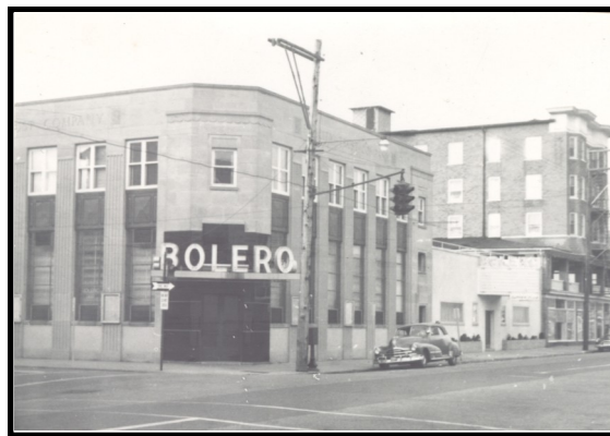
Bolero - 1960